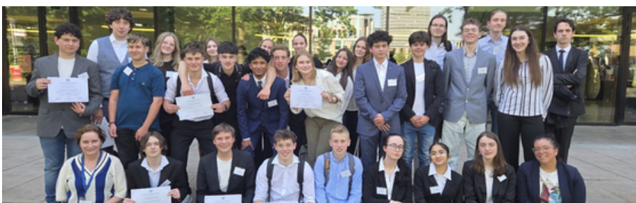
TTO 5 MODEL UNITED NATIONS IN NIJMEGEN