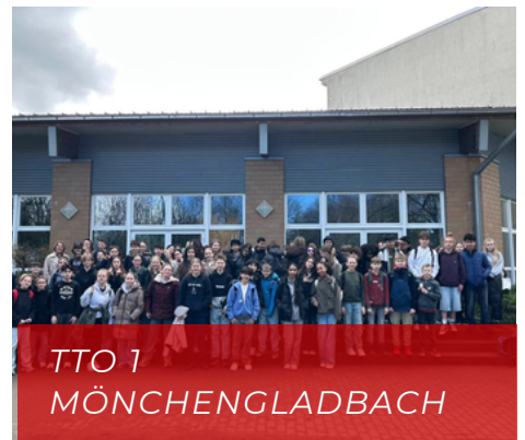
TTO 1 MÖNCHENGLADBACH