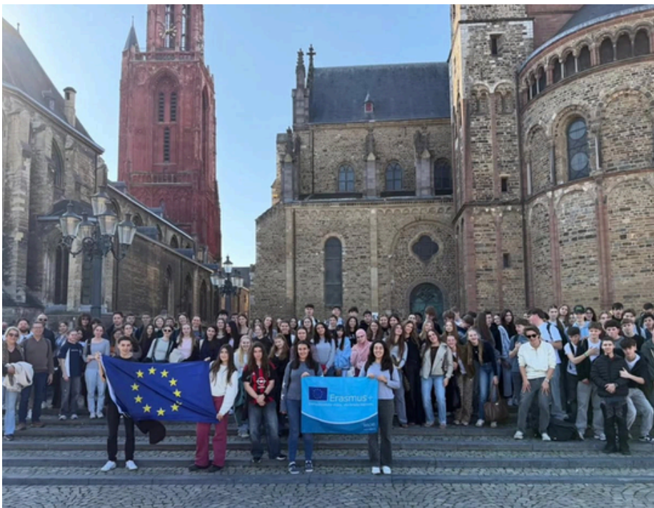
TTO 3 EXCHANGE IN THE NETHERLANDS

Our TTO 3 were finally able to welcome back their buddies. This time into their own homes! A special thank you to all the parents who made this possible. They had a fun-filled week that included trips to the impressive American Cemetery in Margraten and the iconic streets of Amsterdam. See page 2 for a glimpse into their exciting week.