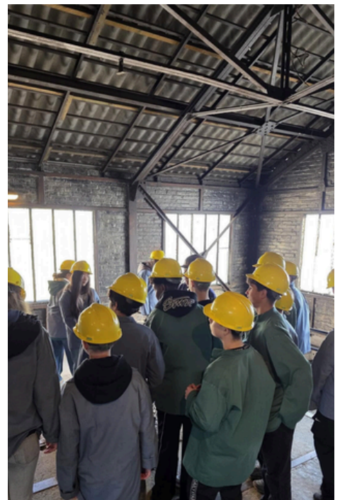
TTO 2 BLEGNY MINES